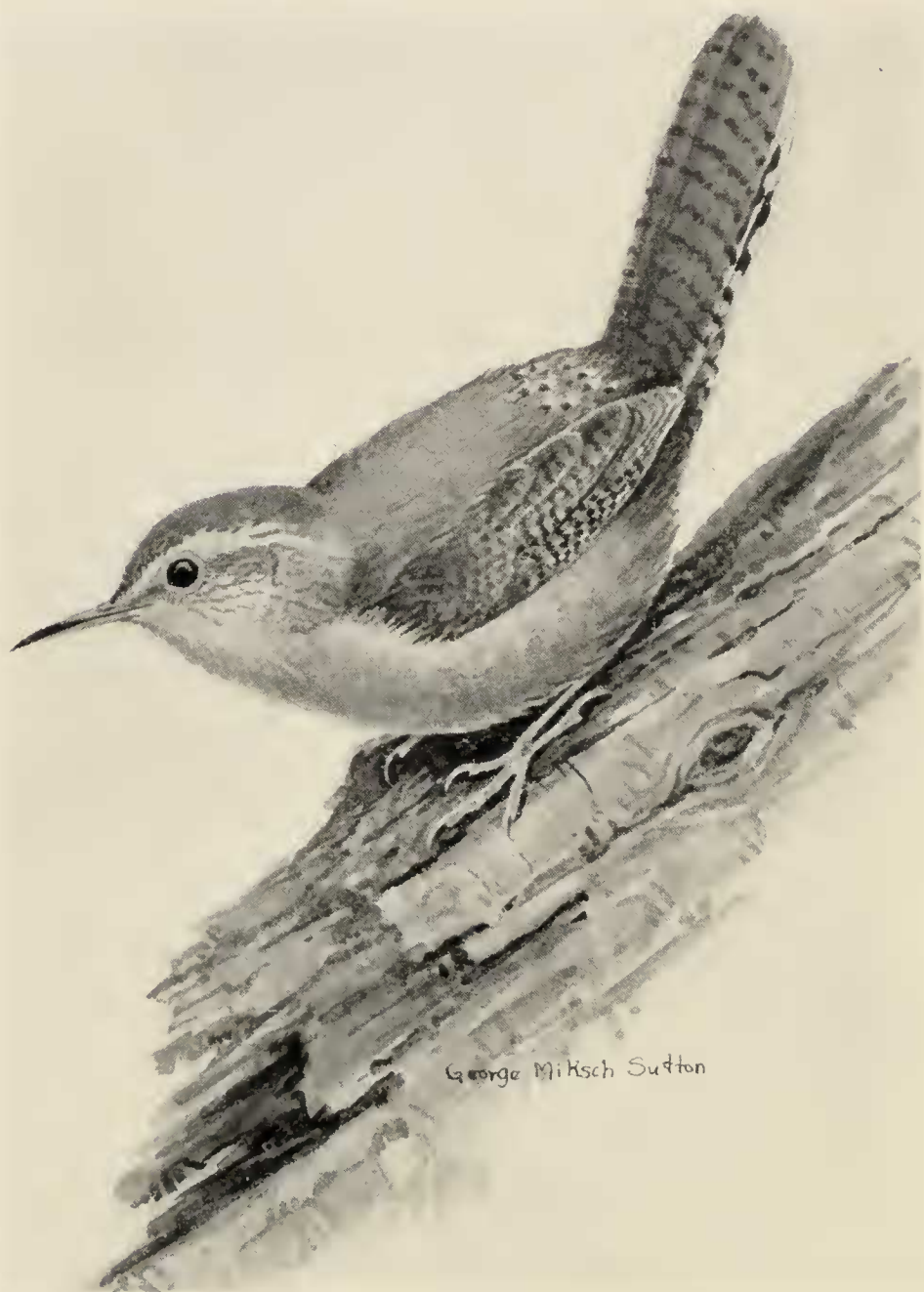
BEWICK'S WREN (Life Size)

wren is responsible for ousting the Bewick's Wren in this region it may be the Carolina Wren. The Bewick's Wren seems to be an altogether inoffensive, rather unobtrusive creature though I confess I